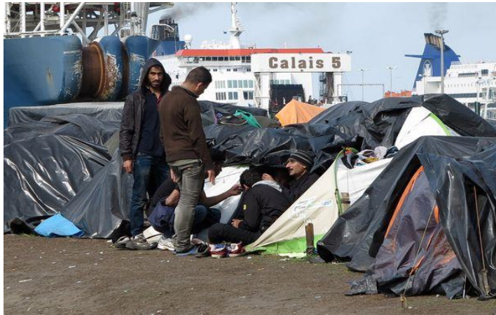
Men wait for the opportunity to stow away on a lorry