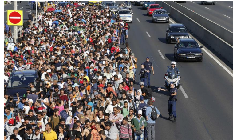
Migrants walking out of Budapest in the direction of Vienna