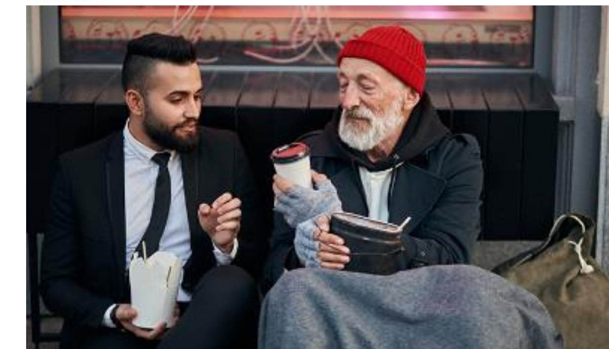
Promoting social cohesion and convergence

Nasjonale eksperter (korrespondenter) samler inn data til de ulike observatoriene.