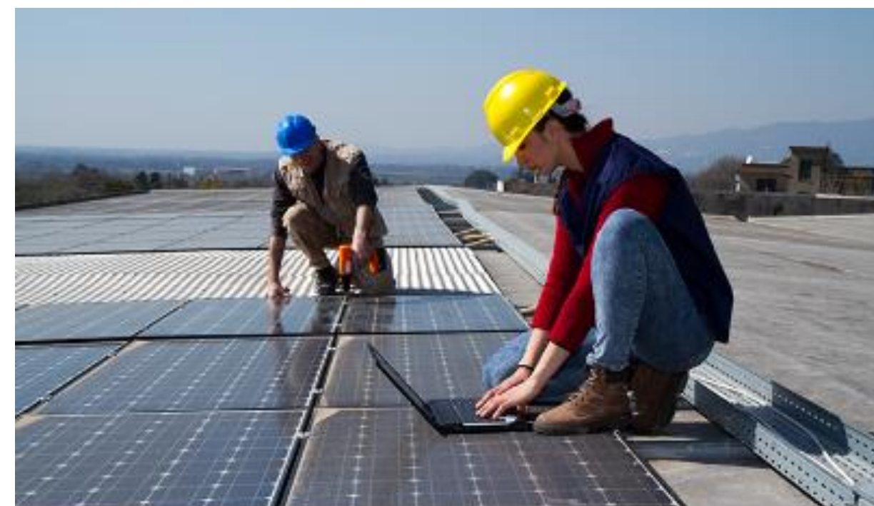
Anticipating and managing the impact of change