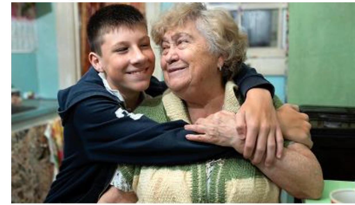
Living conditions and quality of life