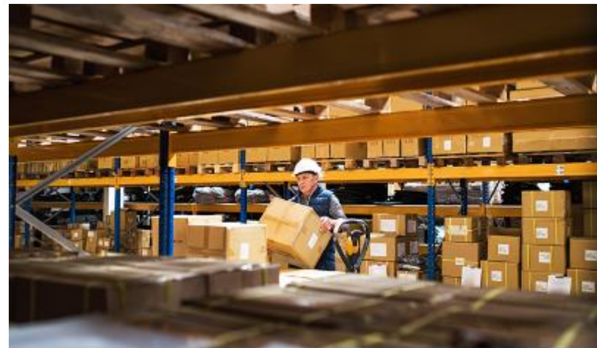
Employment and labour markets