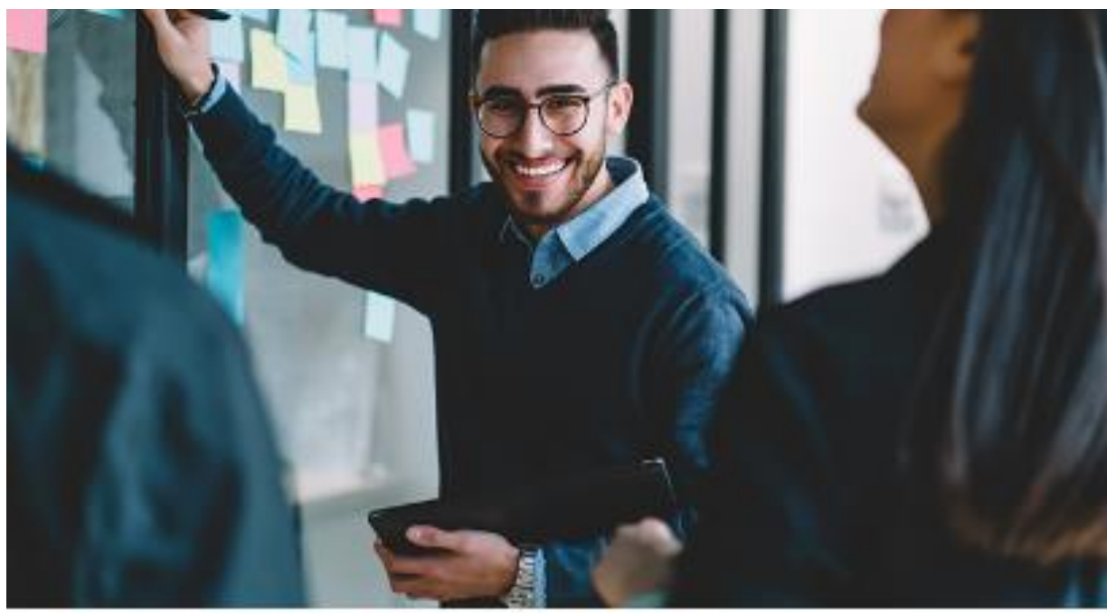
Working conditions and sustainable work