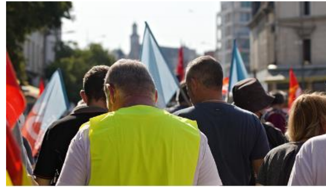
Industrial relations and social dialogue